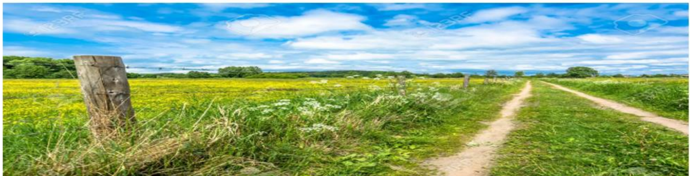
The Gchools Wellbeing Gervice Gummer Walk and Talk Gessions

These walks will be facilitated by a Primary Mental Health Worker and will focus on coping skills and management of presenting difficulties.