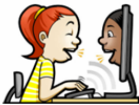
A Parent's Guide to Social Media