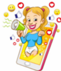
A Parent's Guide to Online Influencers