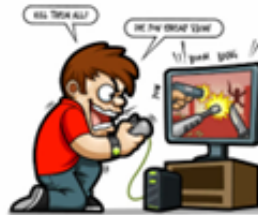
A Parent's Guide to Gaming