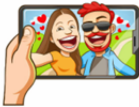
A Parent's Guide to Sharing Pictures