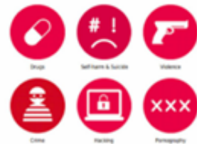
A Parent's Guide to Privacy Settings

Online safety is when young people know who they can tell if they feel upset by something that has happened online.