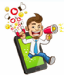
A Parent's Guide to Live Streaming