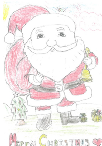
Yaa A-O 7E